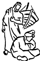
St. Thomas the Apostle writes in India