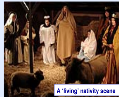
A 'living' nativity scene