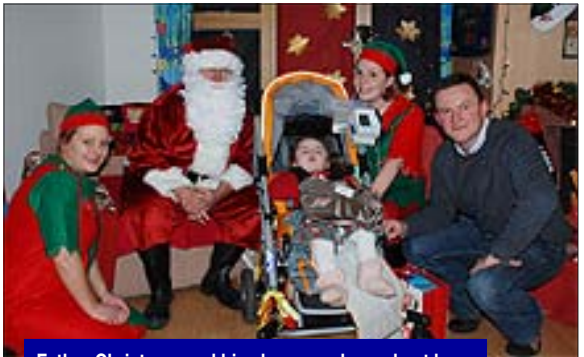
Father Christmas and his elves are always kept busy

The work can be divided into two areas: the shop itself and the back room. Out front volunteers operate the till, assist customers, tidy the rails and monitor security. Another important task is the sale of the weekly lottery tickets. Even if customers cannot find an item to purchase they can always buy a lottery ticket. In the back