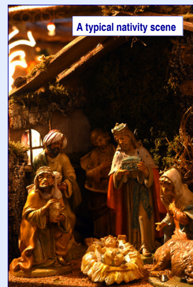
A typical nativity scene

Christmas cribs or nativity scenes usually show us Jesus, Mary and Joseph together with the shepherds and animals found in the stable where Jesus was born. On 6 January, the feast of the Epiphany, the coming of the wise men to visit Jesus is celebrated. The shepherds and animals are removed, and are replaced by the wise men. Cribs used to remain in churches until 2 February when the presentation of Jesus in the Temple is celebrated. Now it is most common for cribs to be removed after the first Sunday of the Epiphany, the Baptism of Christ.