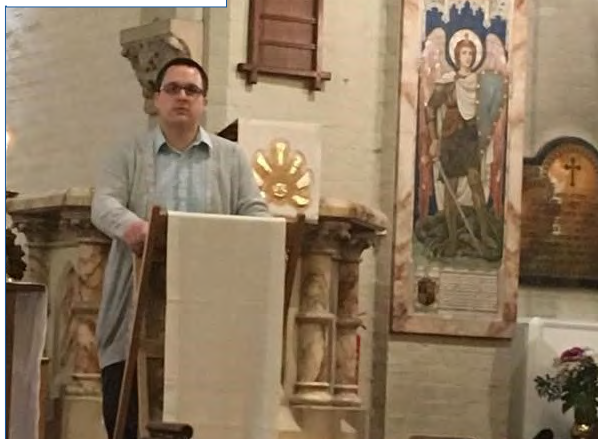
Preaching at St James's has become a rewarding experience

I am finding interesting ways that they structured their society and expressed and passed on the memory of their communities, which