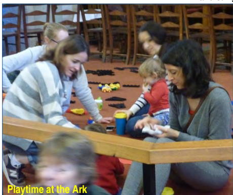
Playtime at the Ark