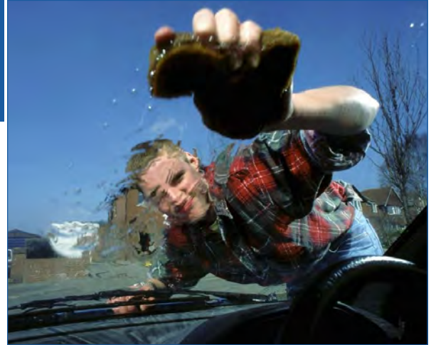
Modern Day Slavery can often be found at car washes

The idea that slavery exists in one of the richest countries in the world is hard to believe. It is thought there are 14,000